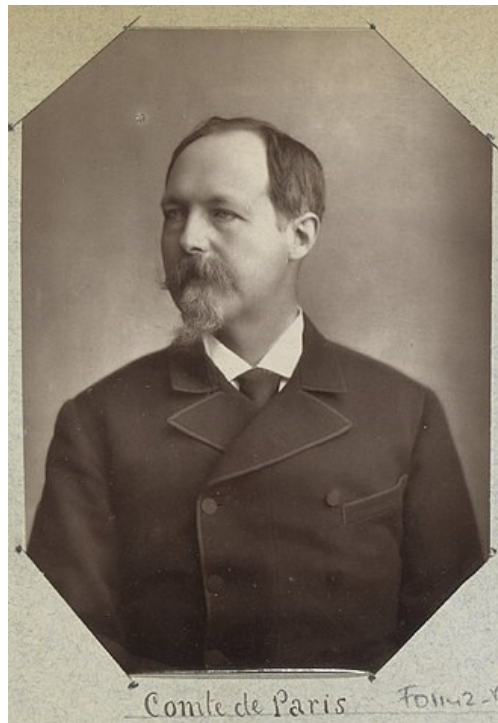
Prince Philippe circa 1890

Even though he resigned from the Union Army in July 1862, Prince Philippe was just getting started with his involvement with the war. On returning to England he became a journalist and historian. He wrote a seven-volume history of the war, Histoire de la guerre civile en Amérique (History of the Civil War in America) that appeared between 1874 and 1888. His work was translated into English and published in four volumes. A small publishing house has recently reissued the English version in paperback.