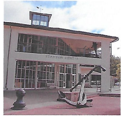
Monterey History & Art at Stanton Center 5 Custom House Plaza Monterey, California 93940