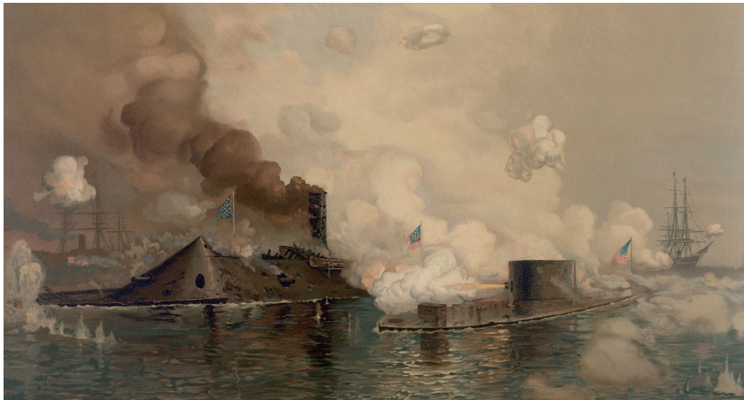
USS Monitor engages the CSS Virginia

The word “monitor” becomes a generic term to describe a broad class of ships in many navies.