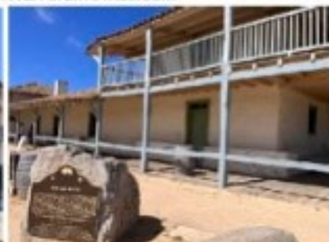
Stanton Center, left, and Custom House on Monterey's historic plaza