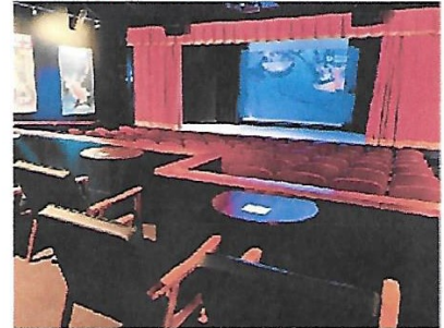
All presentations will be held in the comfortable 100-seat theater at the Stanton Center

Parking is available at the Waterfront Parking Lot at the intersection of Del Monte Avenue and Washington Street. Additional parking is available at the East and West Parking Garages located at Del Monte Avenue and Tyler St.