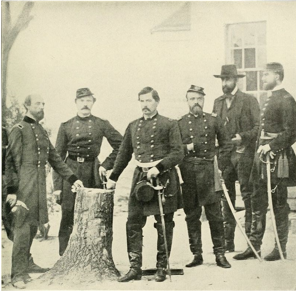
George McClellan and his staff, 1862. Prince Philippe is at far right.