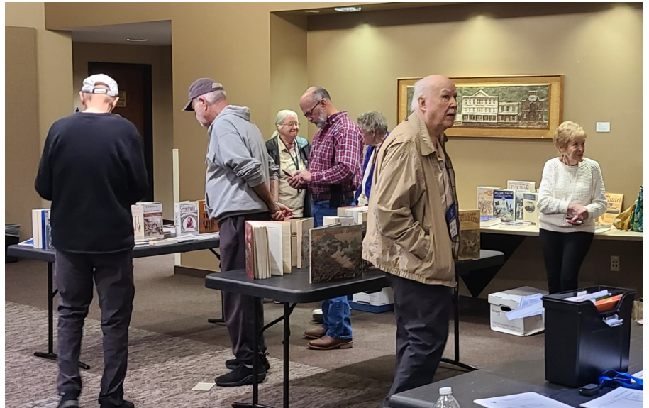
Left and Below: SCWRT members enjoying lively discussions before December's meeting