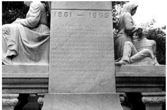
This is the only monument that pays tribute to the women of the Confederacy.

"She was obedient to the God she adored and true to every vow she made to man. She was loyal to the country she loved so well. And upon it's alter laid husband, sire, and son. The home she loved to serve was graced with sincerity of life and devotion to heart. She reared her sons to unselfish chivalry and their daughters to spotless purity. Her children delight to give her honor and love to speak her praise".