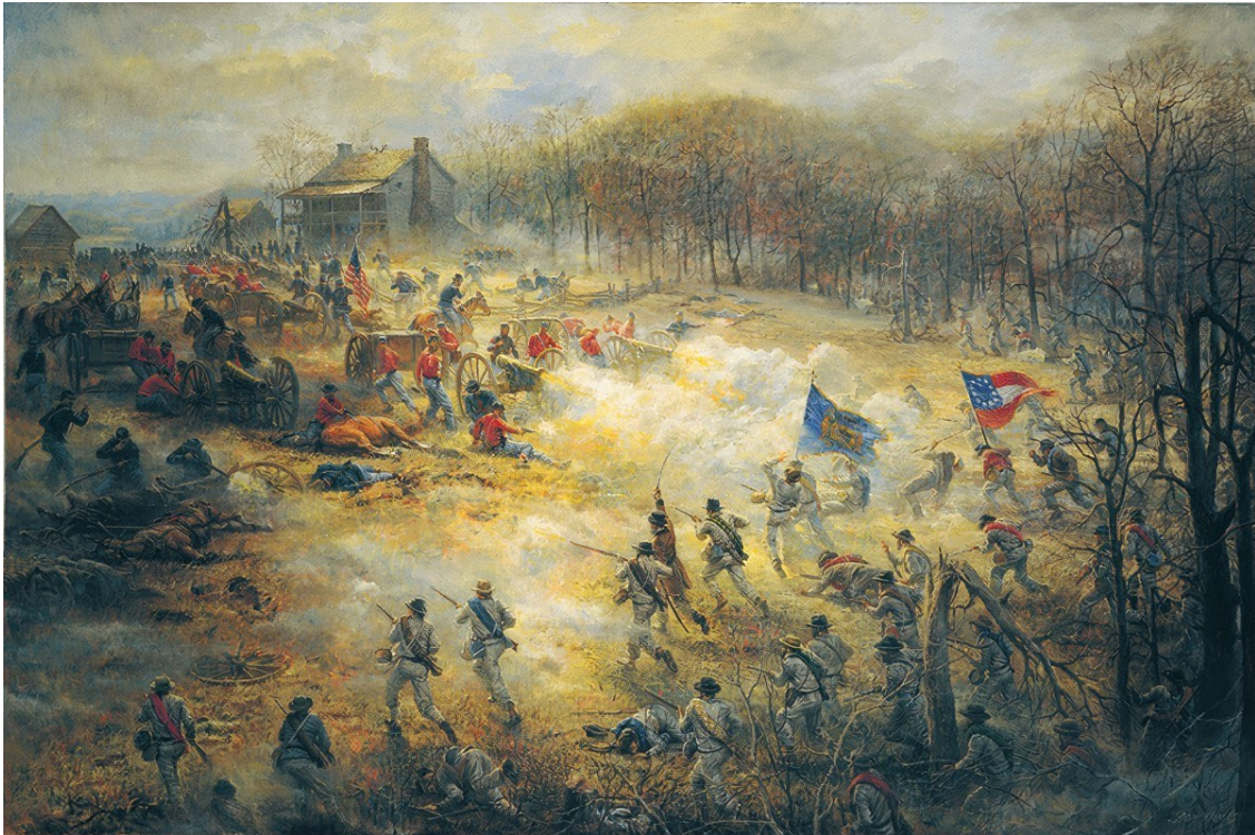
Artist's Rendering of the Battle of Pea Ridge

March 7-8, 1862. In the Battle of Pea Ridge, Arkansas (aka Elkhorn Tavern), the Federal Army of the Southwest, under the command of Brigadier General Samuel R. Curtis, defeats the combined Confederate Army of the West commanded by Major General Earl Van Dorn. This victory is a key factor in deciding whether Missouri will remain in the Union or join the Confederacy.