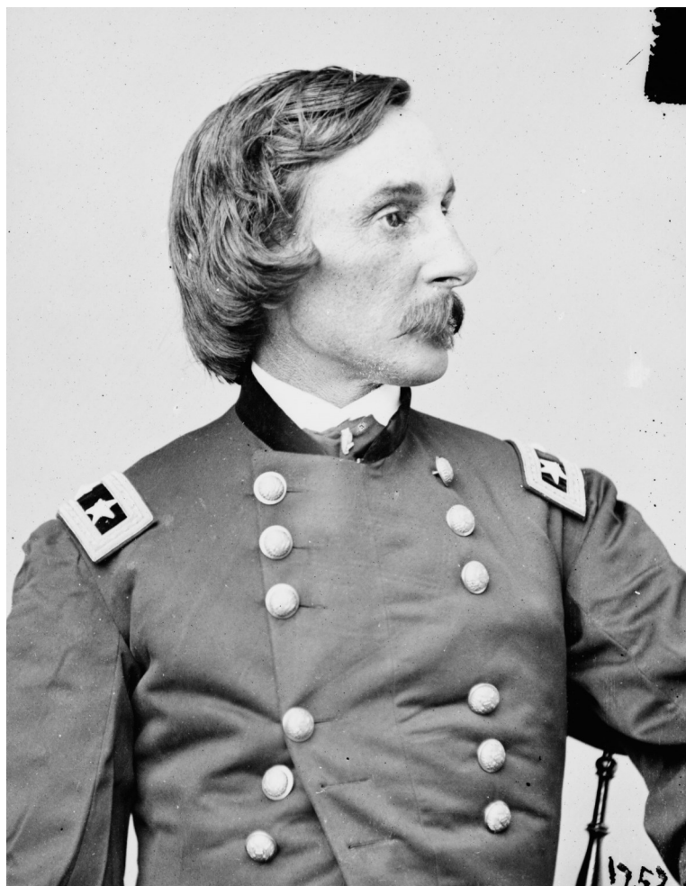
Major General Gouverneur K. Warren

Warren was promoted to major general in August 1863 and led the 2nd Corps after Winfield Hancock was seriously wounded at Gettysburg. Upon Hancock's return from medical leave in 1864, Warren assumed command of the 5 th Corps and led it through the Overland Campaign, the Siege of Petersburg and the Appomattox Campaign.