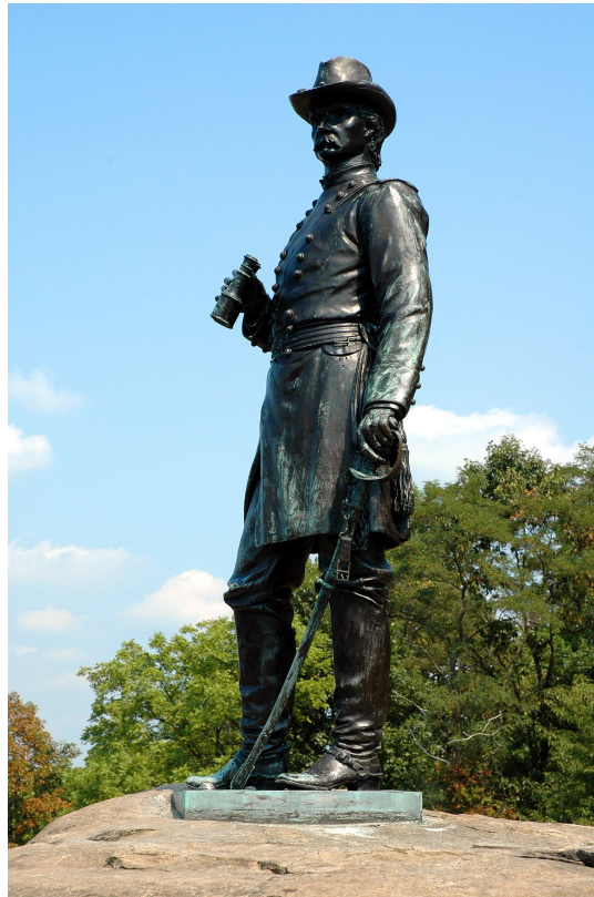
Warren Statue on Little Round Top

Gouverneur Kemble Warren was born January 8, 1830, in Cold Spring, New York, a village almost directly across the Hudson River from the U.S. Military Academy at West Point. He was named after Gouverneur Kemble, a prominent local congressman, diplomat, industrialist and owner of the West Point Foundry, which produced artillery pieces for the U.S. government.