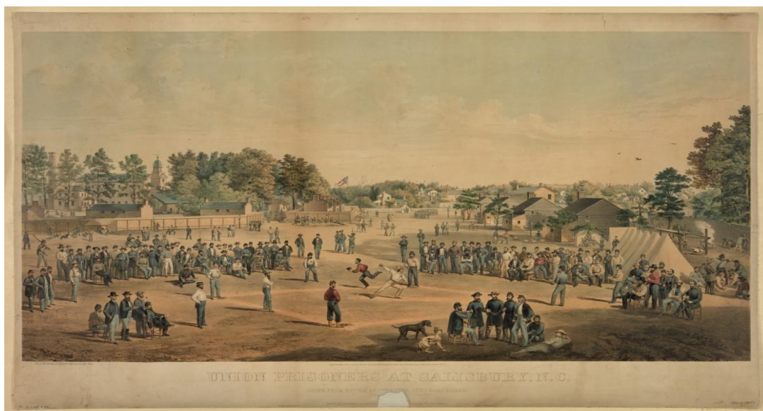
Union Officer POWS Playing Baseball in Salisbury, North Carolina Prison Camp, July 4, 1862

Soldiers returning from the war were eager to set up baseball clubs in their home states. A good way to look at how the war affected the spread of baseball is to look at the numbers. Club attendance figures from NABBP conventions from 1857 through 1867 show baseball’s trajectory toward becoming a national sport. The total number of clubs rose steadily from 14 in 1857 to 23 in 1858; the number of states represented rose from one in 1857, New York, to six plus Washington, D.C. in 1860. The war years, of course, showed a drop in attendance. But a record 91 clubs attended the convention of 1865, just a few months after the war ended. By 1866 so many new clubs applied to join the NABBP that subsidiary state baseball associations had to be set up.